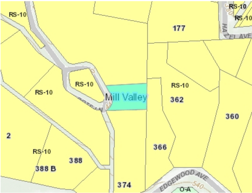
Parcel highlighted in blue

Property ID: 027-265-03 Address: Land Use: Single-Resid. - Unimproved Units: 0 Tax Rate Area: 005-000 Average Slope: 64.09